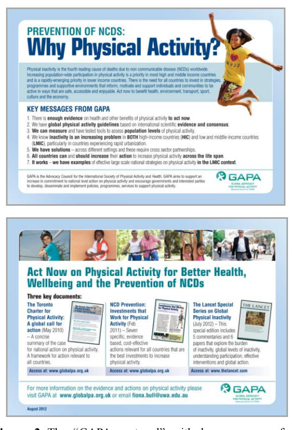
Figure 2 The "GAPA postcard" with key messages for physical activity advocacy on its front side, a call for action and access to key resources on its backside (www.globalpa.org.uk/postcard).

Joint action is also necessary in global health policy. The enthusiasm of physical activity experts after the 2011 UN high level NCD meeting was great, but